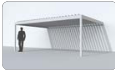
Fitted to an outside wall (1, 2 or 3 columns)