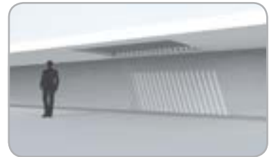
Integration: built into an existing opening