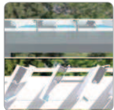
Controlled water drainage when rotating blade is opened