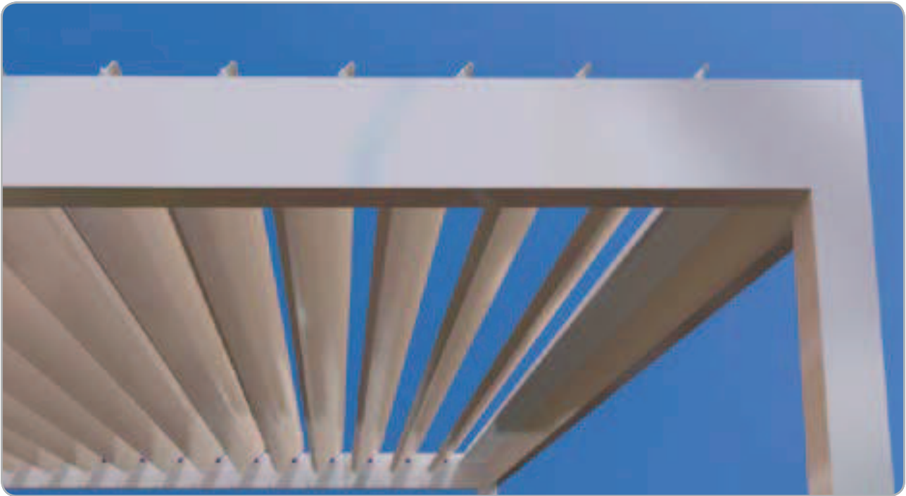
In open position: adjustable sun protection and ventilation