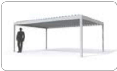
Stand-alone (4 columns)